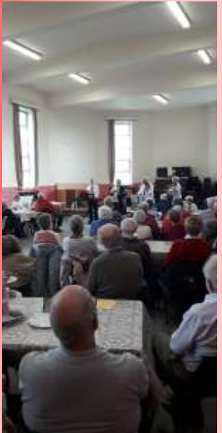
The Pastoral Care Committee Afternoon Tea event in Stamperland Church on 5th September 2019, where as you can see, there was a good attendance and much merriment was had listening to the Loudoun Ceilidh band, Thanks to everyone who baked and helped on the day to make it a success.